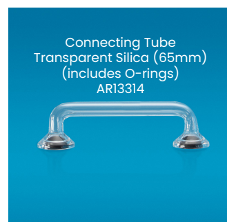
Connecting Tube Transparent Silica (65mm) (includes O-rings) AR13314