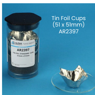
Tin Foil Cups (51 x 51mm) AR2397